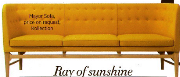
Mayor Sofa, price on request, Kollection

Reinventing the classic Persian carpet has become a popular theme with Arabian manufacturers, but nobody does it quite like Hossien Rezvani. The award-winning designer's new collection goes bold with a brighter palette