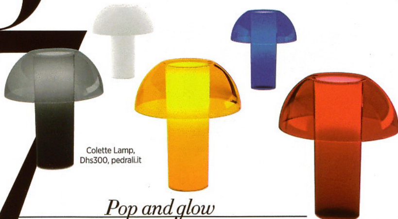
Colette Lamp, Dhs300, pedrali.it

Bursting into our homes this year is a colour we haven't seen since the seventies. Primary yellow, paired with plum, rich blue and pale pink will give you the hottest look for 2013